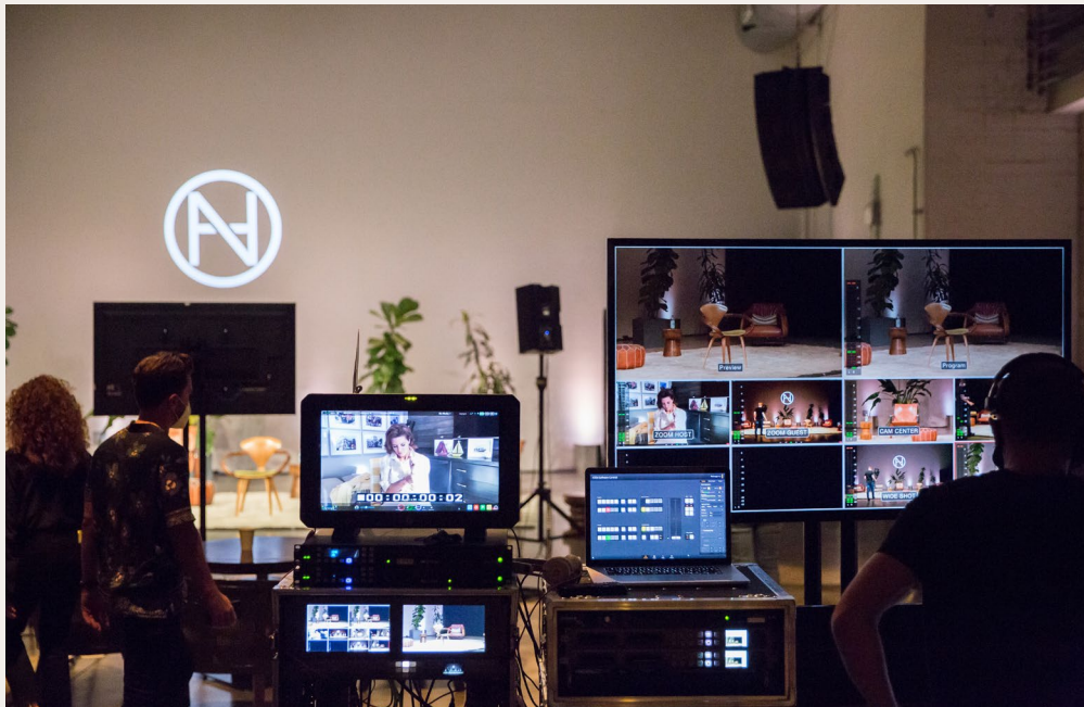
Behind the Scenes