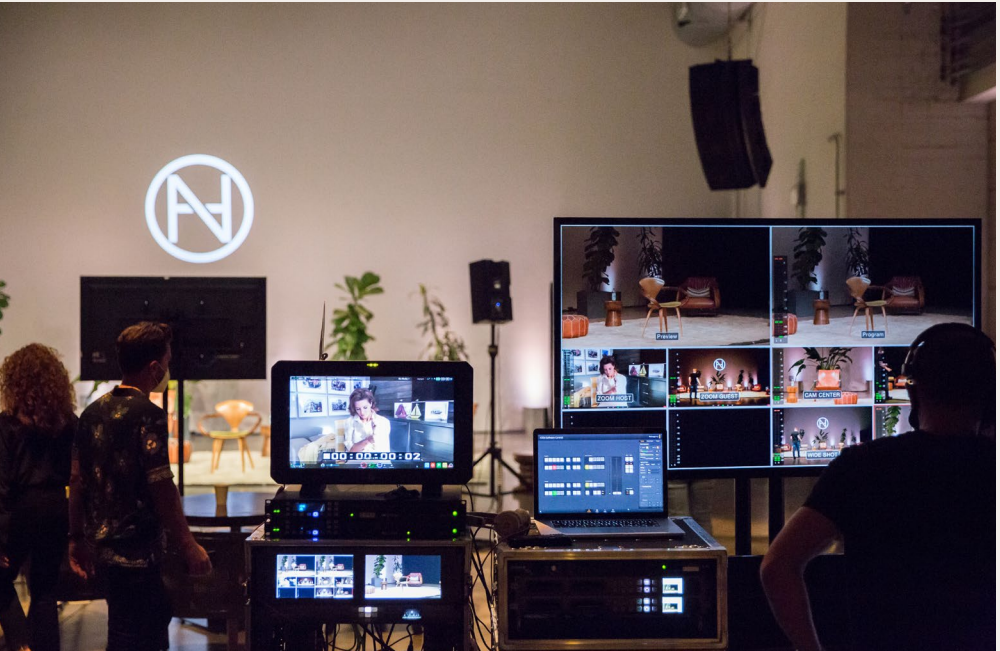
Behind the Scenes