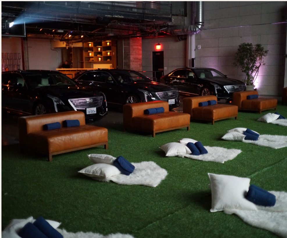
Experiential & Installation